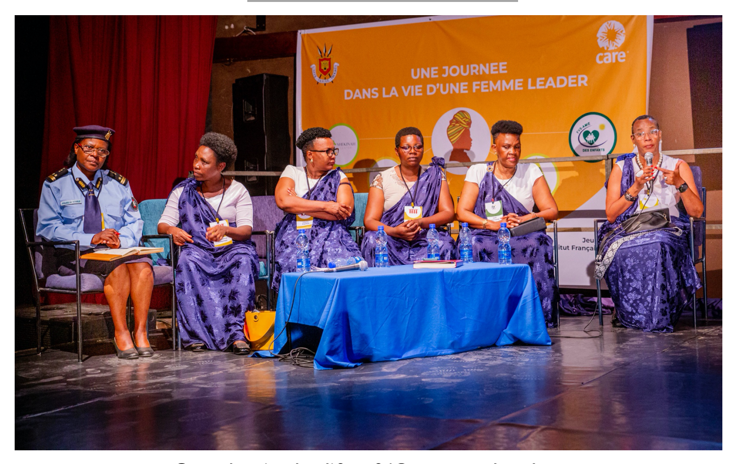
One day in the life of 12 women leaders

The founder of Shekinah Center was selected by Care International Burundi to be part of the Women Leaders Organization (WLO) for an exhibition called "Une journée dans la vie de nos femmes leaders"; A day in the life of our women leaders.